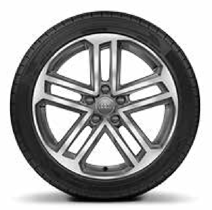
Cast alloy wneels, 5-double-spoke style, contrast gray, size 8] x 18 with 225/40 R18 tyres.